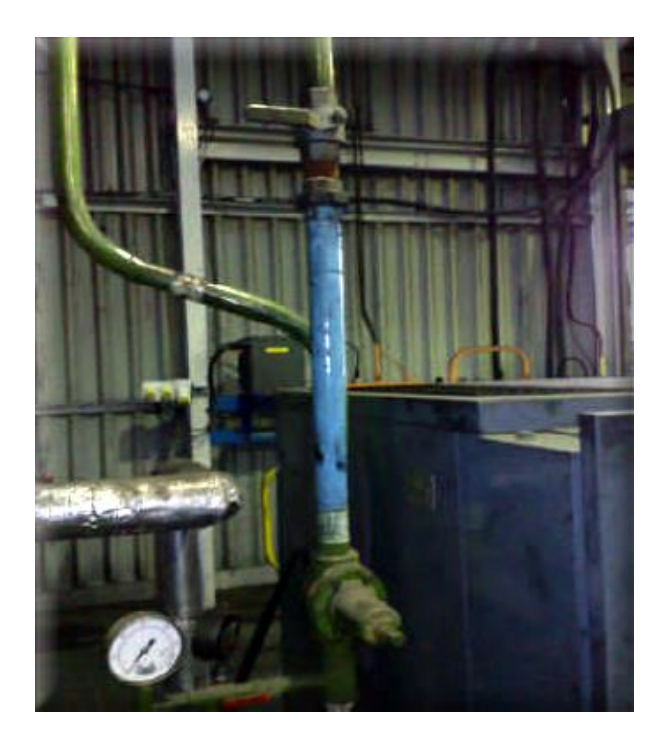
Columbian Chemical Installation

The most recent unit commissioned in 2008 was a 4" Colloid-A-Tron which is a testament to the success and longevity of the treatment on the compressors. Since installation of the first unit not a single compressor has required shutdown for cleaning. One compressor was run as a trial with no treatment for a short period and within six weeks the compressor required a shut down for de-scaling.