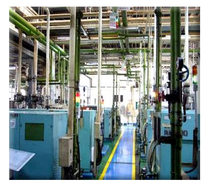
Compressors & Air Dryers at Thai Honda

A series of 220 KW air compressors and air dryers generating compressed air which is used to power various equipment throughout the plant.