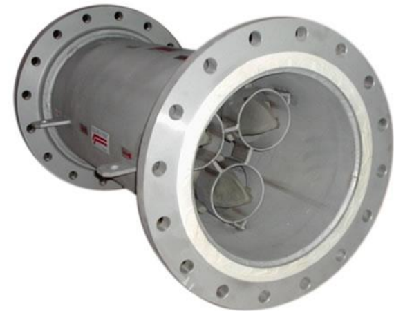
16" diameter unit